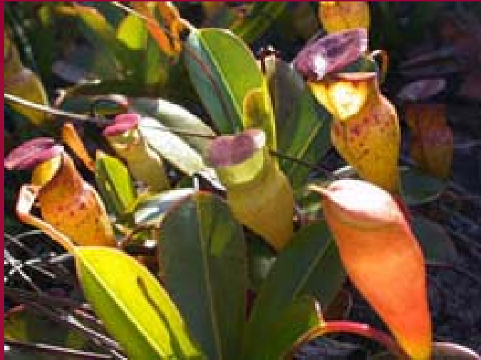
Pitcher Plant; Carnivorous plant

Islands separated from the African continent (Gondwana land) 120 million years ago