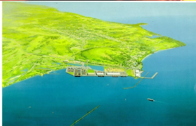
Short-term Development Plan (up to 2005)