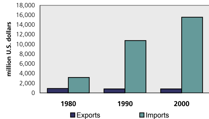
Trade in Fish and Fisheries Products, Japan, 1980-2000

View more Country Profiles on-line at http://earthtrends.wri.org