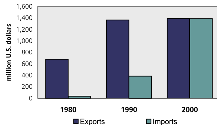
Trade in Fish and Fisheries Products, Republic of Korea, 1980-2000

View more Country Profiles on-line at http://earthtrends.wri.org