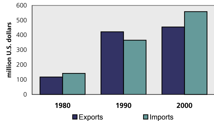
Trade in Fish and Fisheries Products, Singapore, 1980-2000

View more Country Profiles on-line at http://earthtrends.wri.org