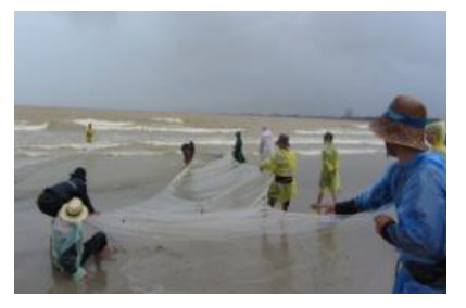
Fishing activity along the coast of Danang Bay

For those who opted to continue fishing, five new ships for offshore fishing worth VND 3.2 billion (US$ 153,000) were fabricated with support from the People's Committee of Danang City. In addition, the following assistance was provided: (I) insurance premium to some 3,000 crew members of fishing vessels with a capacity of over fifty CV; (2) construction of a sea products storage facility; and (3) aid to fishers switching jobs or support equivalent to roughly VND 4 billion (US$ 191,250). The City's program comprised of 660 fishing boats, with forty-two existing boats having been upgraded for offshore fishing, and was further enhanced with the construction of four safety stations.