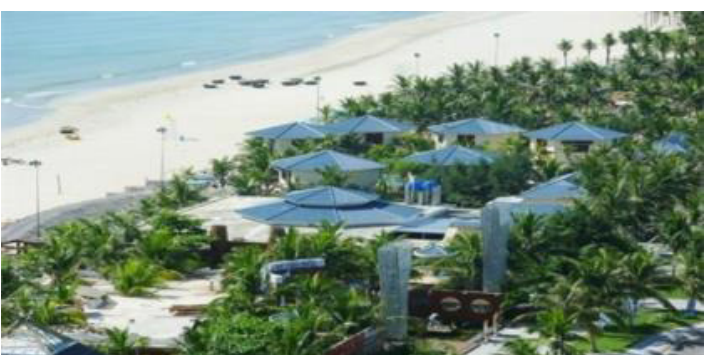
Beach area along Son Tra Peninsula

Both Son Tra and Ngu Hanh Son Districts have attracted numerous foreign and domestic investors to build 4-5 star vacation resorts of international standard. As a result, a significant increase in tourist arrivals has been recorded over the years (see box I for information on tourist arrivals in the first quarter of 2015), which provides tremendous job opportunities for local people and brings revenue to the district as well as to the City.