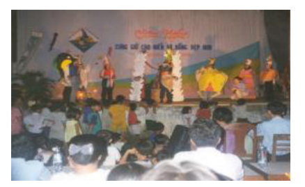
Public awareness activities involving the various sectors in Danang