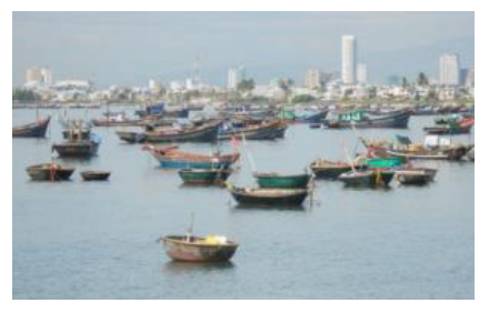
Fishing boats in Danang Bay