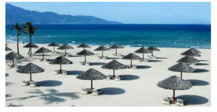
Beach area before and after rehabilitation