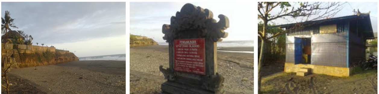
The west side of Yeh Gangga Beach: Photos show: (A) The headland separating the east and west sides of Yeh Gangga Beach; (B) an announcement that prohibits putting up commercial establishments, gathering rocks and disposing waste on the beach area, with corresponding fine of Rp 1,000,000 for offenders based on the District Regulations of Tabanan Regency and Customary Laws of Yeh Gangga Traditional Village; and (C) the drinking water supply facility. Tourism facilities and enterprises are found behind the beach set back zone.