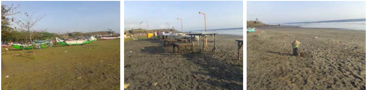
The east side of Yeh Gangga Beach: Facilities for fisheries activities and religious ceremonies were set up, based on the zoning plan. The beach is also used for meditation and spiritual cleansing.

Programs for the tourist services group, on the other hand, included establishment of restaurant stalls, souvenir shops, development of tour guiding services, and development of cooperation with local tourism entrepreneurs in managing tourist attractions. Efforts to enhance tourism services and facilities are still ongoing.