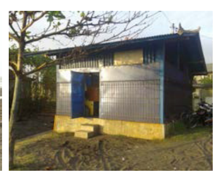
The west side of Yeh Gangga Beach: Photos show: (A) The headland separating the east and west sides of Yeh Gangga Beach; (B) an announcement that prohibits putting up commercial establishments, gathering rocks and disposing waste on the beach area, with corresponding fine of Rp 1,000,000 for offenders based on the District Regulations of Tabanan Regency and Customary Laws of Yeh Gangga Traditional Village; and (C) the drinking water supply facility. Tourism facilities and enterprises are found behind the beach set back zone.