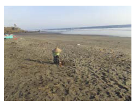
The east side of Yeh Gangga Beach: Facilities for fisheries activities and religious ceremonies were set up, based on the zoning plan. The beach is also used for meditation and spiritual cleansing.