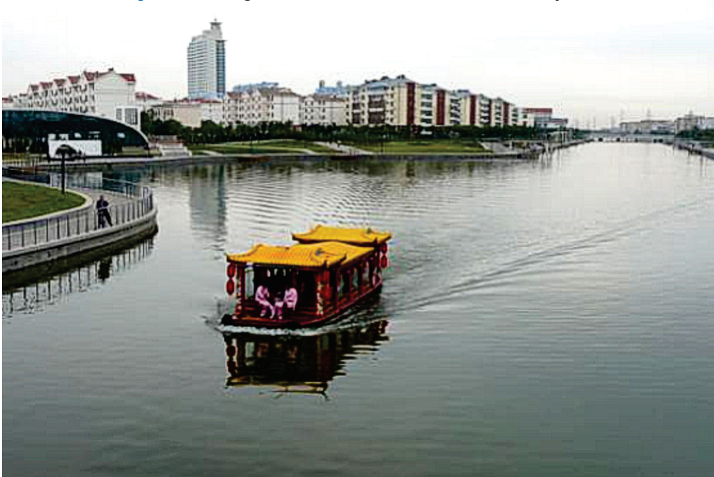
Figure 2. Guangli River after the Pollution Reduction Project.

Over the last ten years, the water quality of Guangli River gradually improved and was able to meet the approved water quality standards. Fish and bird populations in the river have reportedly increased (Figure 2; EPB, 2005; EPB, 2010a; Sina, 2013; Dazhong, 2015). There were