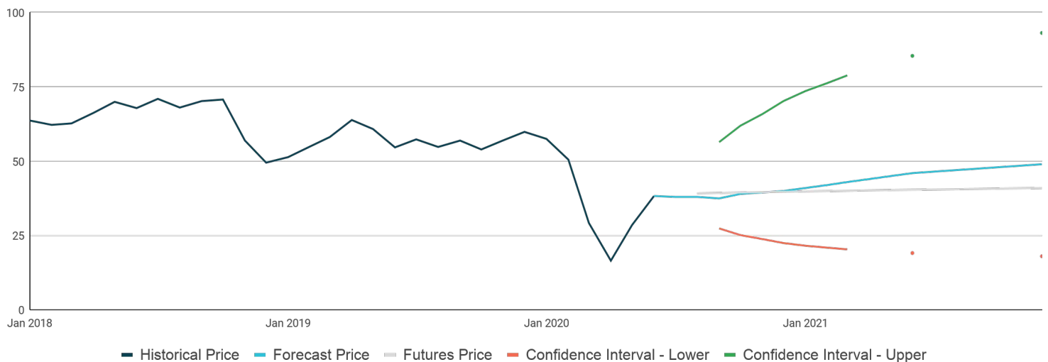
Table: Historical and forecasted crude oil prices (and future price and 95% confidence intervals), based on the best case of West Texas Intermediate (WTI) prices, by US Energy Information Administration (EIA)