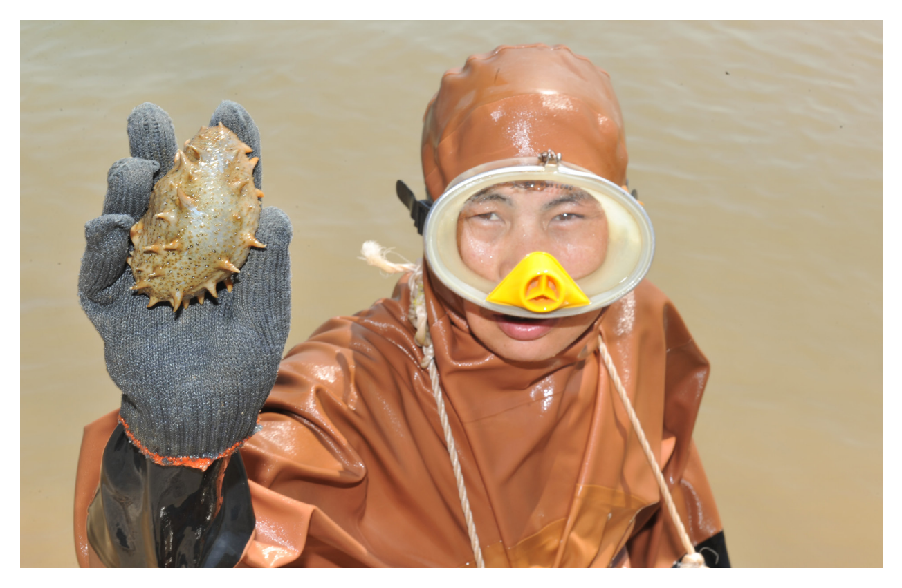
Ecologically friendly aquatic products such as sea cucumbers fetch high market prices, with the support of market development and consumer awareness.

In 2009, the Chinese Government called for the development of marine industries and establishment of modern industry clusters to boost economic growth. In May 2009, Dongying adopted an ICM Strategy, which included actions to achieve the dual objectives of developing the aquaculture industry and improving the marine environment through the demonstration of intensive and highly efficient modern aquaculture.<sup>4</sup>