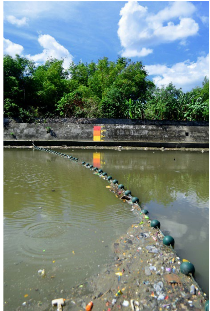
A trash boom helps trap and collect floating riverine debris in Bacoor.

Data relating to plastic waste generation was obtained by analyzing the 10-year Solid Waste Management (SWM) plans of the seven cities and municipalities located within the boundaries of the river watershed: Tagaytay, Silang, Amadeo, Dasmariñas, Imus, Bacoor, and Kawit.